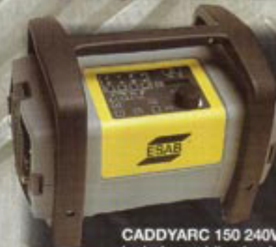
CADDYARC 150 CADDYTIG 200 Indoors or out you can rely on your Caddy, portable solutions for professionals