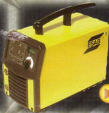
E0459200887 ORIGOTIG 150 240V

Proven inverter technology guarantees quality and reliability in welding performance. Inc. welding leads and TIG Torch