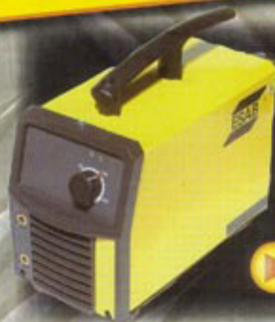
E0459200886 ORIGOARC 150 240V

A very portable and easy to use welding machine, lightweight and powerful