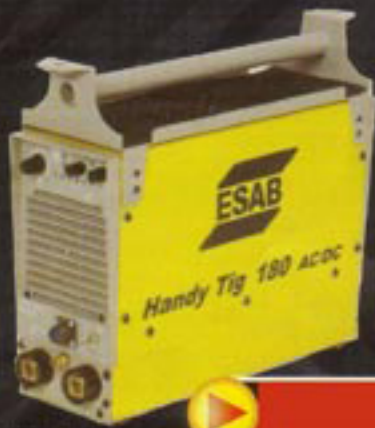
E0457377880 HANDY TIG DTF180 240V AC/DC For craftsmen and repair maintenance. For welding aluminium and stainless using the TIG process. Includes BTF150 TIG Torch ready for welding